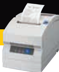
Model: CD-S500S Standard Model