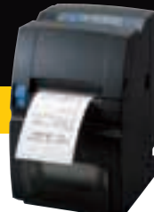
Model: CD-S500S Vertical solution in black