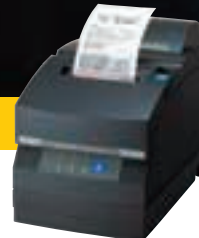
Model: CD-S503S With auto cutter/ winder Model