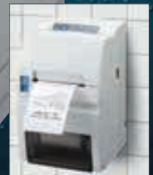
Wall mount kit (option)