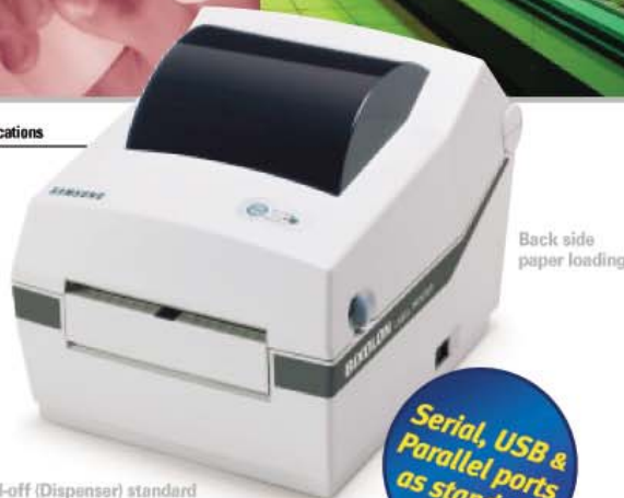
Back side paper loading

Serial, USB & Parallel ports as standard!