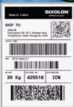
Variable barcode types available (1D/2D)